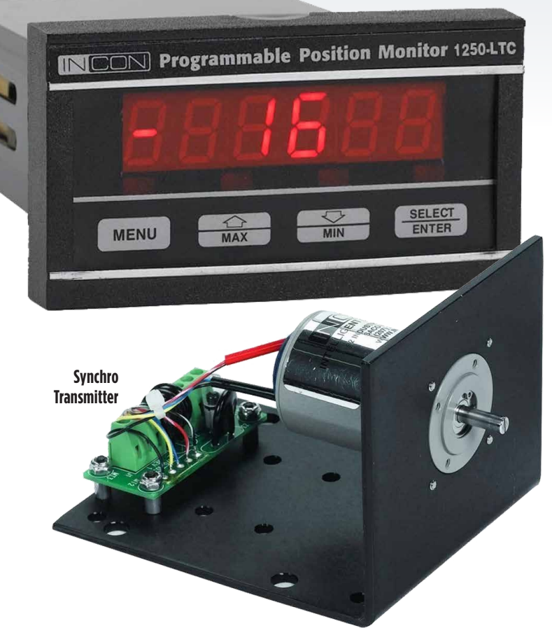
LTC Position Monitor