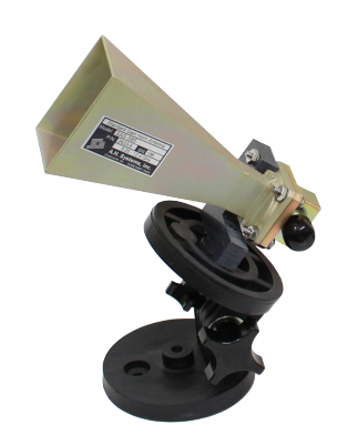
* pictured mounted on an AEH-510 Tripod head

This Standard gain horn antenna has medium gain, low VSWR, and a constant antenna factor: excellent for both immunity and emissions testing.