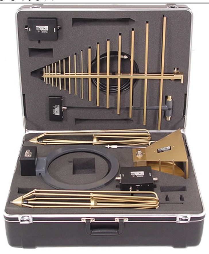
Shown with optional preamplifiers