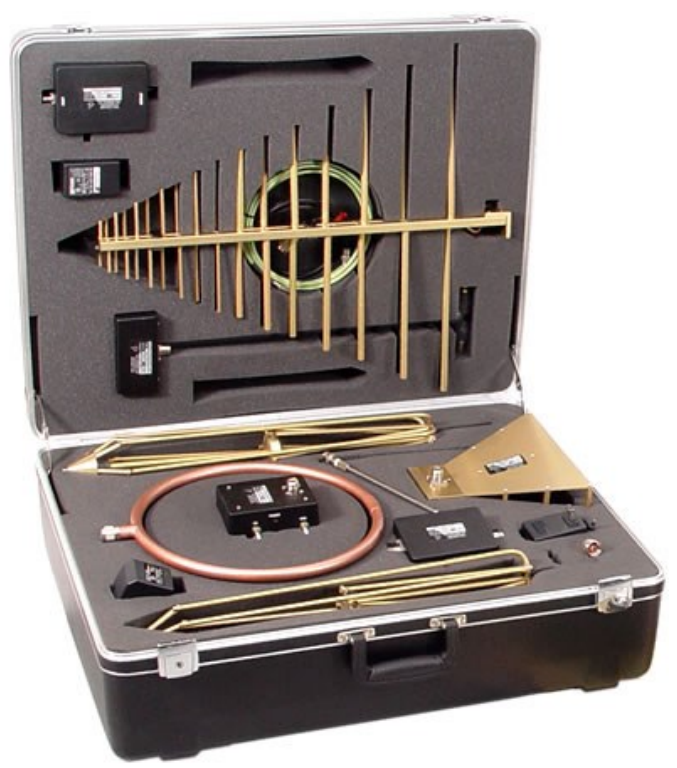
Shown with optional preamplifiers